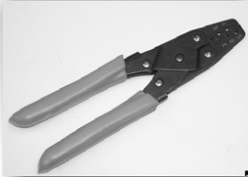
Single wire crimp tool. Used for smaller gauge terminals. p/n 500518 .....$45

American Autowire has high quality crimp tools for your project !