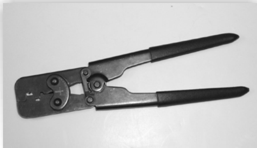
Double crimp tool. Used for larger gauge terminals and double wire crimps. p/n 500523 .....$89.95